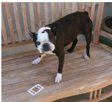
Jonty doesn't like being Dummy